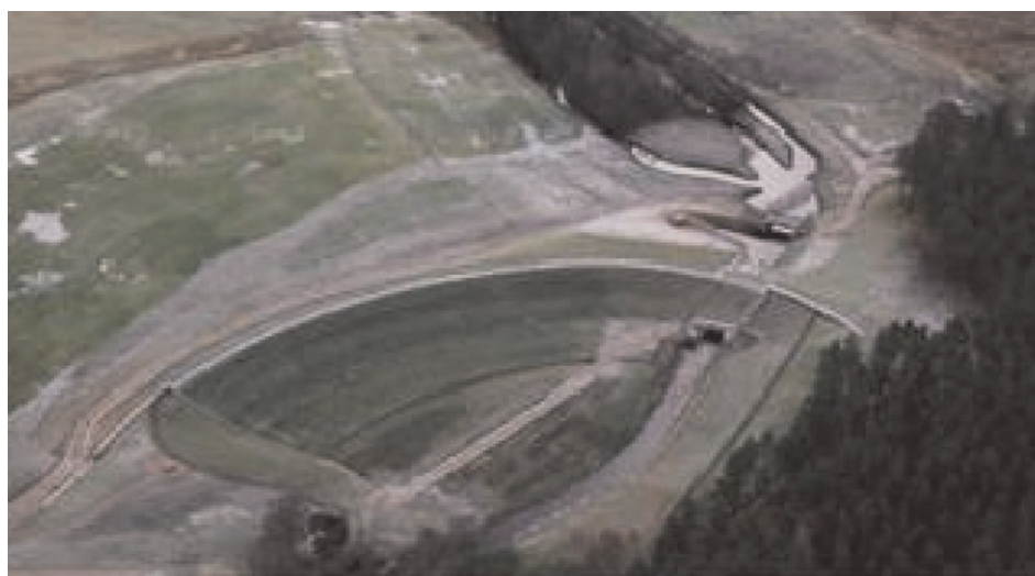
Figure 14.4 Chapelton dam

Like any hydraulic control structure, the hydraulic performance of the baffled crump weir may be compromised if it were to be partially obstructed, or even completely blocked due to the excessive accumulation of sediment or debris. Consequently, the control of sediment and floating debris being conveyed downstream by the Burn