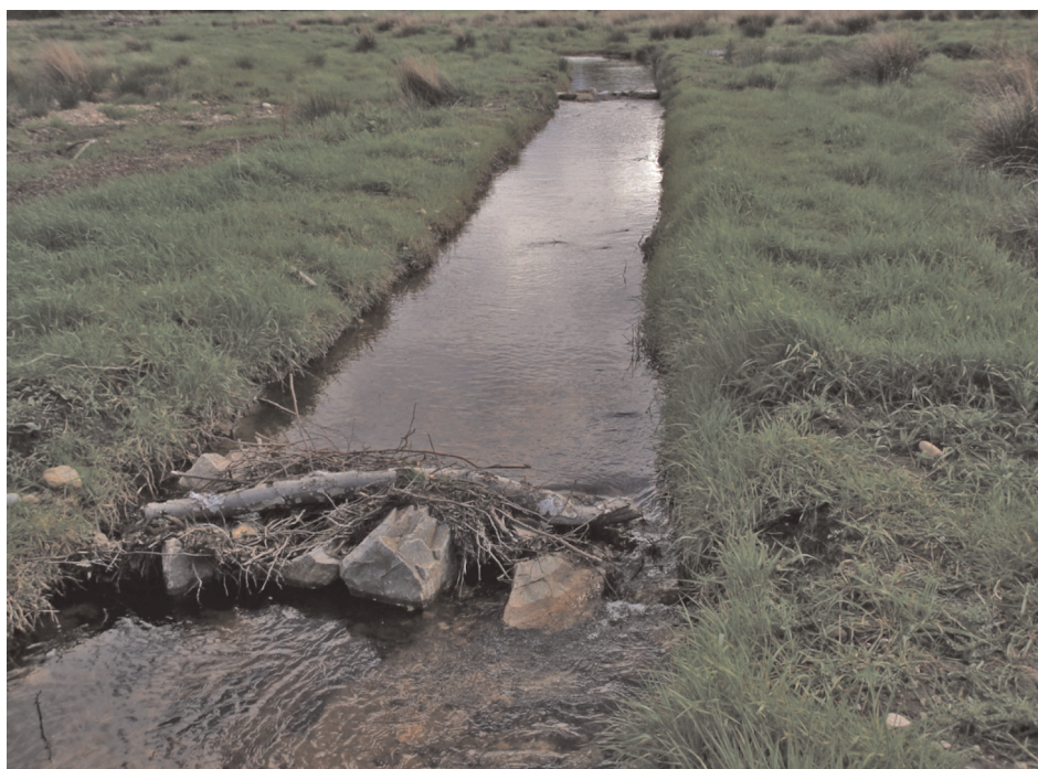
Figure 14.11 Low boulder weirs constructed in the pilot channel and intended to encourage formation of a pool and riffle sequence. These have been successful in trapping LWD, but have not been effective in promoting pool and riffle formation

These steps would have resulted in a better functioning and more aesthetically pleasing initial channel form.