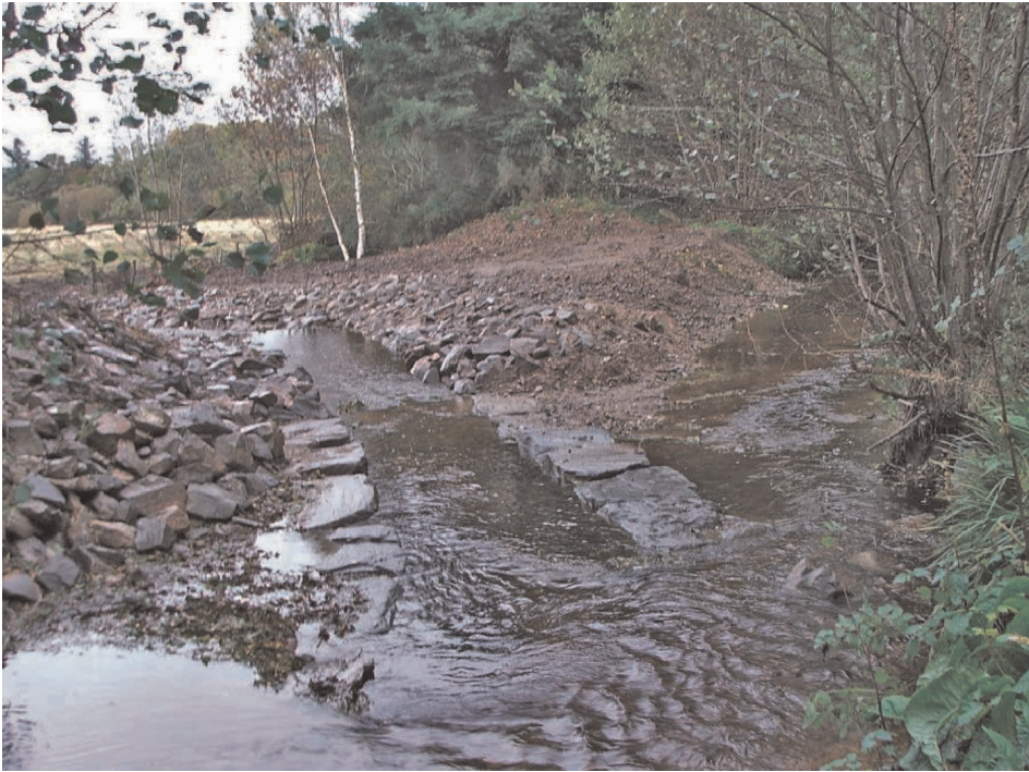
Figure 14.6 Engineered breach as constructed in November 2008 to divide flow between the new channel (left) and the existing Burn (right). Note the block stone and riprap scour protection