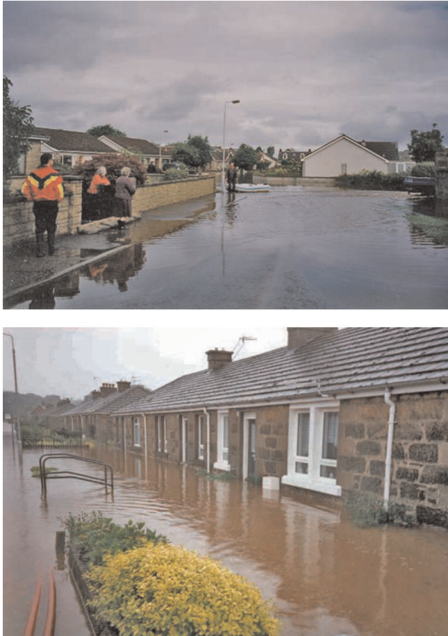
Figure 14.2 Flooding in Forres during the 1997 event

these are carried into urban area of Forres, where they are mostly deposited in Sanquhar Loch, which is an artificially impounded water body located on the southern edge of the town. The field survey further revealed that the Burn carries considerable quantities of organic debris, including leaves, twigs and large wood. The findings of the geomorphological assessment indicated that, to reduce the unacceptably high flood risk in Forres sustainably, it was essential to design a scheme that accounted for the dynamics of sediment and organic debris, as well as those of the floodwaters.