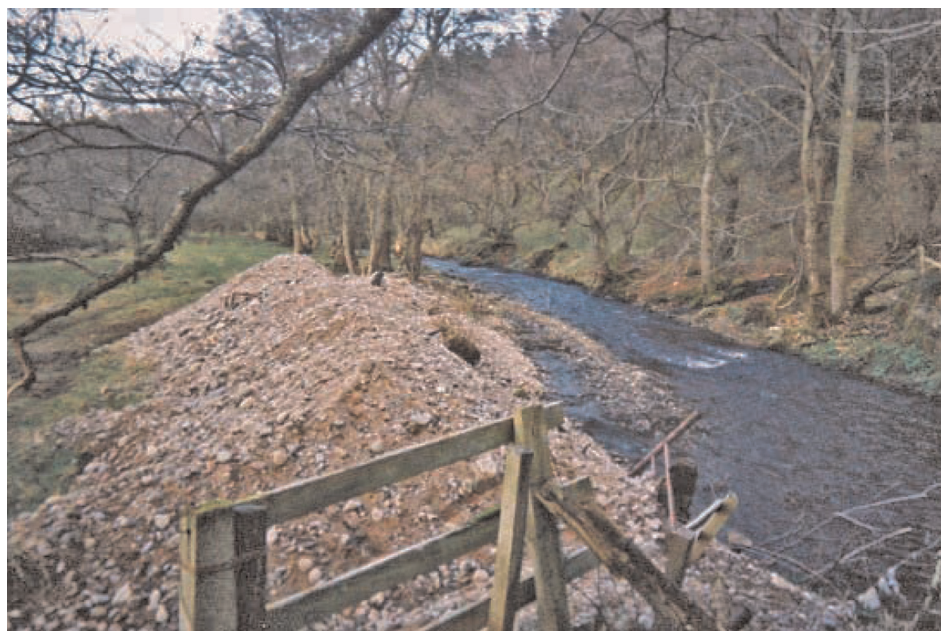
Figure 14.3 Gravel removal and ad hoc embanking of the channel of the Burn of Mosset upstream of Forres

the town) to flood storage, removal of properties in vulnerable areas, and changes in catchment management. The criteria by which the options were appraised were developed by the stakeholders at a value management workshop.