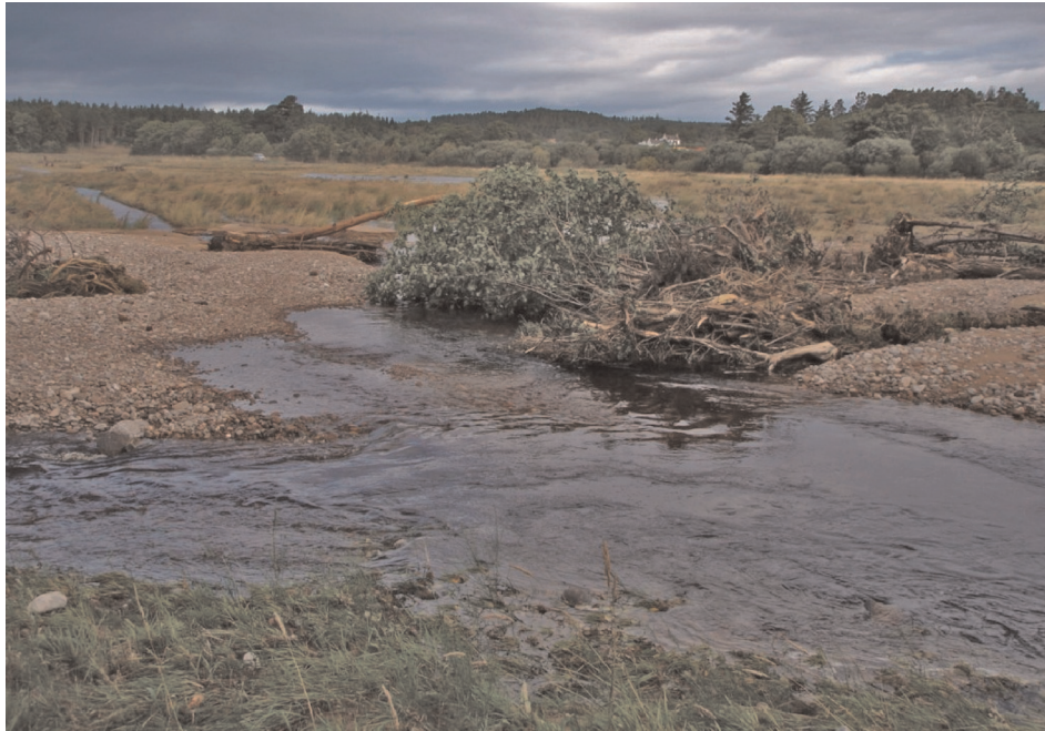
Figure 14.10 Interaction between grounded LWD, fluvial processes and sediment dynamics in the Burn Management Works. Note the remnant of the pilot channel in the upper left of the photograph, the scour pool in the foreground, the anabranch on the left and the extensive coarse sediment deposition

approaching the control structure within the dam. LWD permanently grounded in the Burn Management Works is also interacting with fluvial processes and sediment dynamics to drive local scour, deposition, bar building, channel evolution and habitat diversification (Figure 14.10).