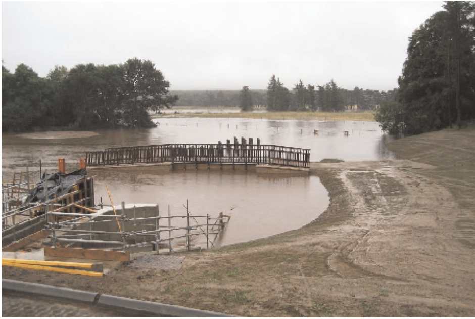
Figure 14.8 Anabranching downstream of the upstream breach following the 4 September 2009 flood event. Note the development of anabranching upstream of the straight, pilot channel in the left foreground