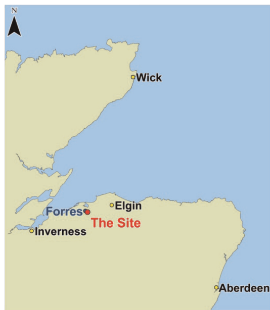
Figure 14.1 Forres location map

allowance for climate change up to 2080. Peak flow during the 1997 event was estimated at 48 \text{ m}^3/\text{s} . During that event, approximately 430 homes and 27 commercial properties were inundated (Figure 14.2) and regional communications were seriously disrupted, with both the A96 trunk road and the Inverness to Aberdeen mainline railway being closed due to flooding.