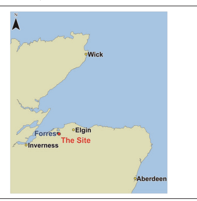
Figure 14.1 Forres location map

allowance for climate change up to 2080. Peak flow during the 1997 event was estimated at 48 \text{m}^3 /s. During that event, approximately 430 homes and 27 commercial properties were inundated (Figure 14.2) and regional communications were seriously disrupted, with both the A96 trunk road and the Inverness to Aberdeen mainline railway being closed due to flooding.