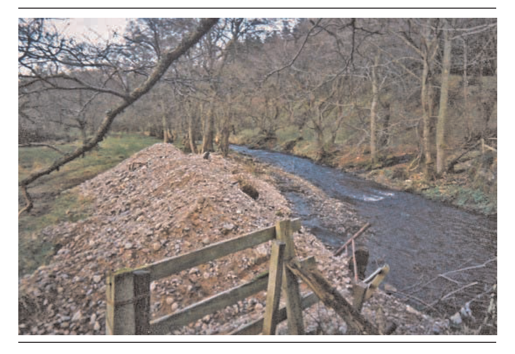
Figure 14.3 Gravel removal and ad hoc embanking of the channel of the Burn of Mosset upstream of Forres

the town) to flood storage, removal of properties in vulnerable areas, and changes in catchment management. The criteria by which the options were appraised were developed by the stakeholders at a value management workshop.