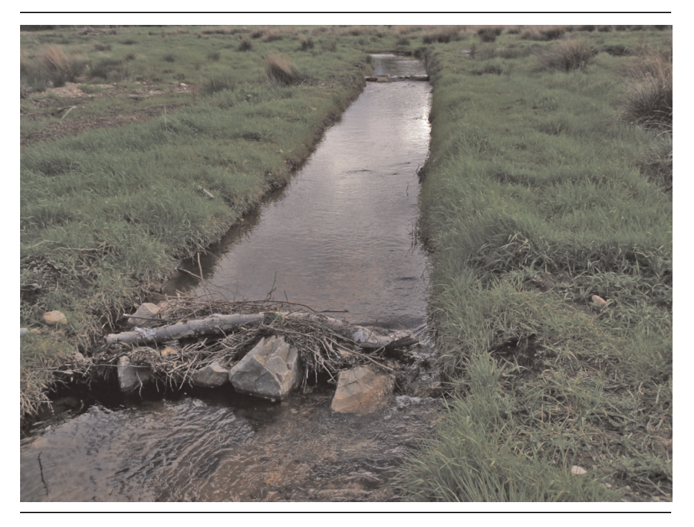
Figure 14.11 Low boulder weirs constructed in the pilot channel and intended to encourage formation of a pool and riffle sequence. These have been successful in trapping LWD, but have not been effective in promoting pool and riffle formation

These steps would have resulted in a better functioning and more aesthetically pleasing initial channel form.