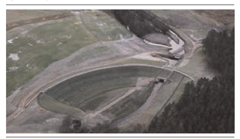
Figure 14.4 Chapelton dam

Like any hydraulic control structure, the hydraulic performance of the baffled crump weir may be compromised if it were to be partially obstructed, or even completely blocked due to the excessive accumulation of sediment or debris. Consequently, the control of sediment and floating debris being conveyed downstream by the Burn