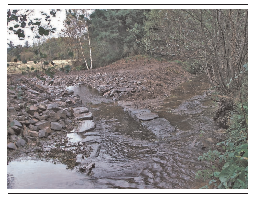
Figure 14.6 Engineered breach as constructed in November 2008 to divide flow between the new channel (left) and the existing Burn (right). Note the block stone and riprap scour protection

stream) that would act as a natural sediment accretion zone with a large capacity to store material ranging in size from cobbles to sand