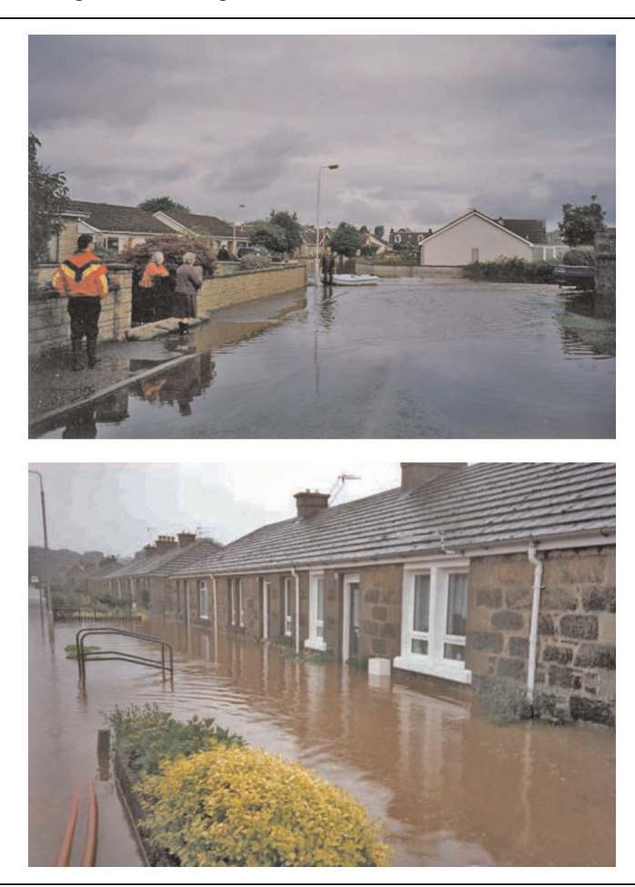
Figure 14.2 Flooding in Forres during the 1997 event

these are carried into urban area of Forres, where they are mostly deposited in Sanquhar Loch, which is an artificially impounded water body located on the southern edge of the town The field survey further revealed that the Burn carries considerable quantities of organic debris, including leaves, twigs and large wood. The findings of the geomorphological assessment indicated that, to reduce the unacceptably high flood risk in Forres sustainably, it was essential to design a scheme that accounted for the dynamics of sediment and organic debris, as well as those of the floodwaters.