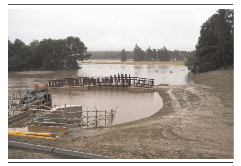
Figure 14.8 Anabranching downstream of the upstream breach following the 4 September 2009 flood event. Note the development of anabranching upstream of the straight, pilot channel in the left foreground

Figure 14.7 First impoundment by the Chapelton Dam on 4 September 2009 – less than a week after implementation of the FAS